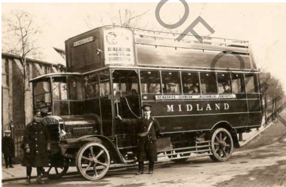
An early (1920s?) Midland Bus standing outside St. Thomas's Church. Note the hard tyres and open top deck.

With grateful thanks to Arriva for supplying information for this article.