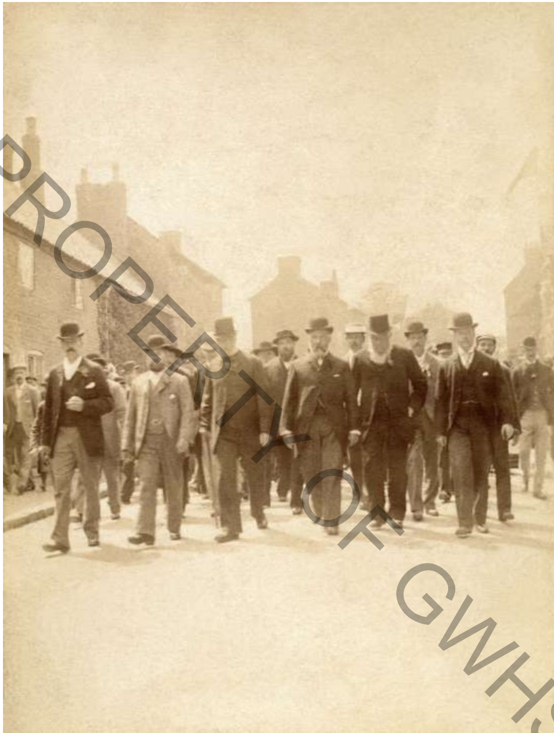
The first members of the new council walking along Long Street, believed to be moving from the National School to their new meeting place at Bell Street School.