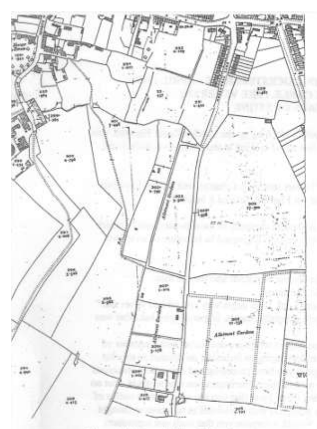
Horsewell & Steven's Close allotments to west of Horsewell Lane