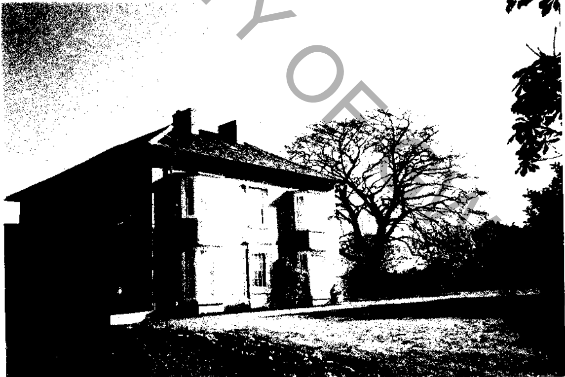
The Grange in 1990s

Sources: Sale Catalogue - LRO 3D42/M33/3, Grangeway Road deeds in private hands, Belgian Refugees ?? Cannot recall the source at time of writing!