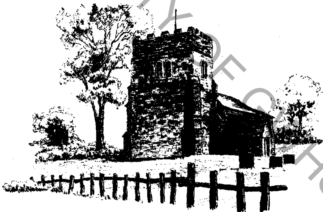
St Giles Church Great Stretton