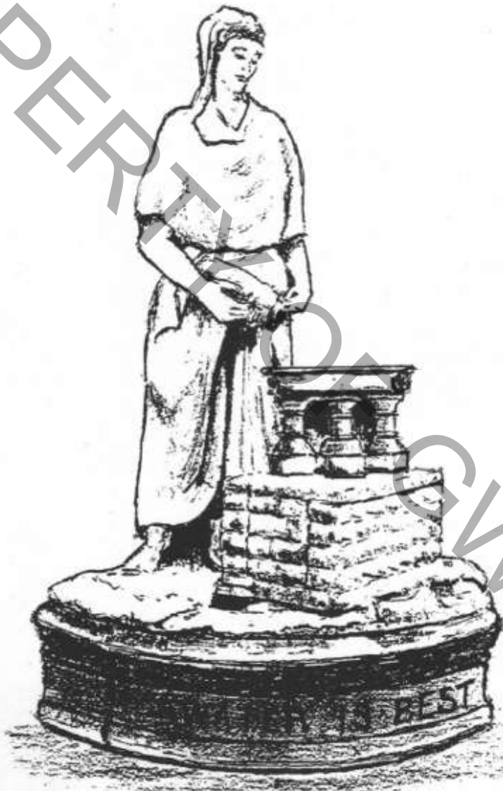
REBECCA AT THE WELL. A FOUNTAIN ERECTED BY THE BATH TEMPERANCE SOCIETY 1861. BATH. J.R. COLVER.