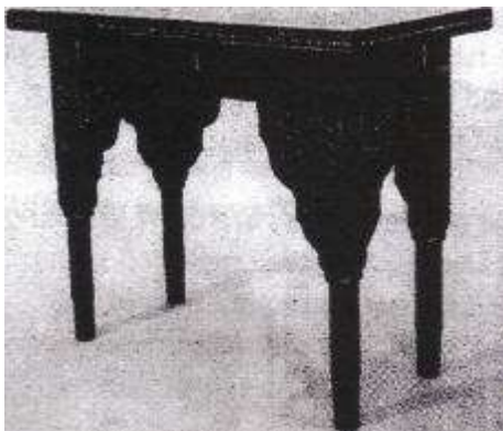
lateVictorianSideTable designed by Dr Christopher Dresser sold recently for £16,000

Late Victorian Side Table designed by Dr. Dresser sold recently for £16,000