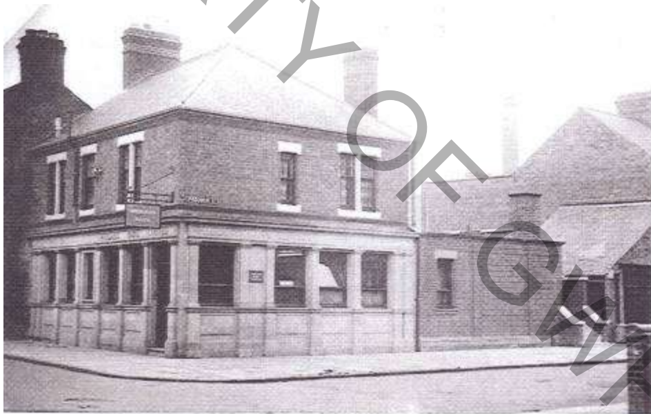
57 Long Street after the Midland Bank conversion. The property was demolished circa 1969 and Neville Chadwick's photography business now occupies the site.